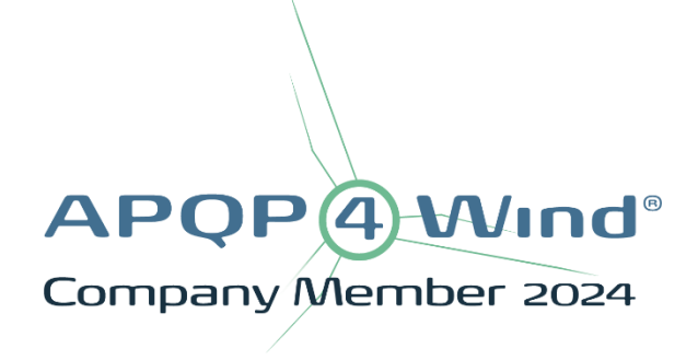
Figure 3: Logo membership APQP4Wind

The customers' demands are the incentive for LSV Lech-Stahl Veredelung to push the boundaries of steel.